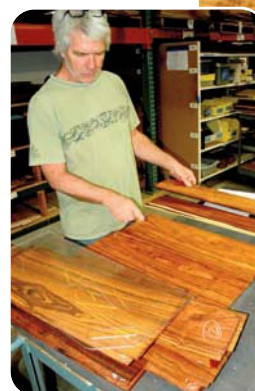
Taylor Guitars in San Diego